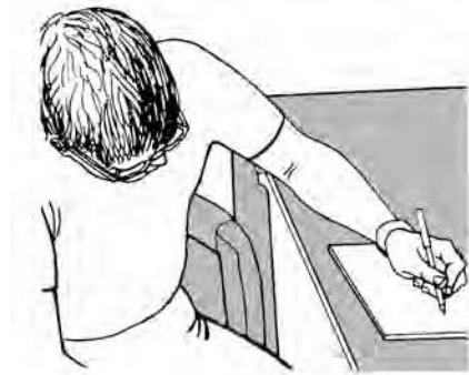
This left-hander had his paper over to his right side, so he sat sideways to write.