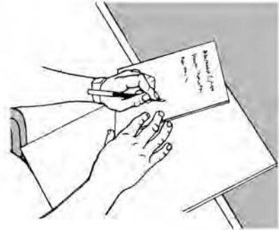
He tried working on a tilted board and liked it. You might like it too.